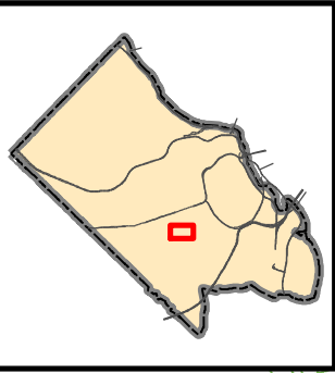
Exhibit B - LED Field Demonstration: Residential