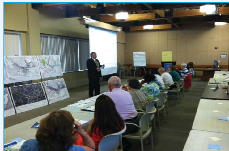
Community Meeting Photo