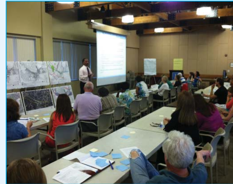
Community Meeting Photo