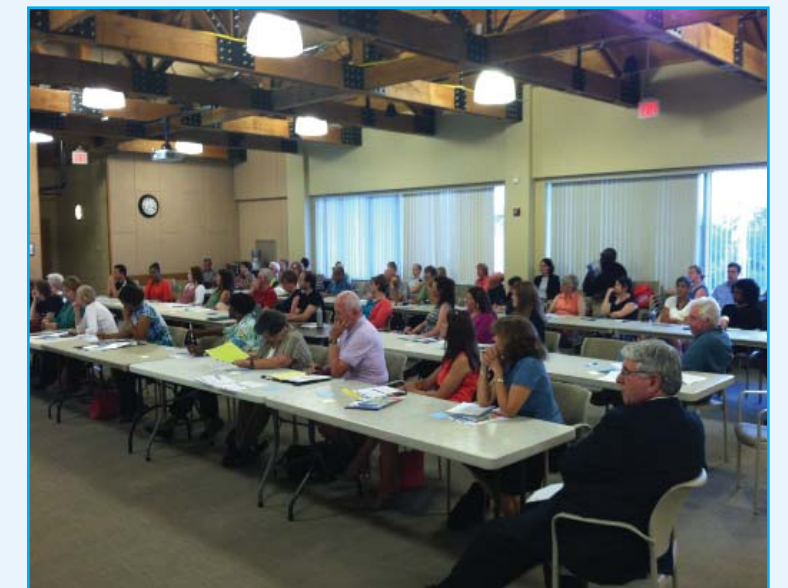
Community Meeting Photo